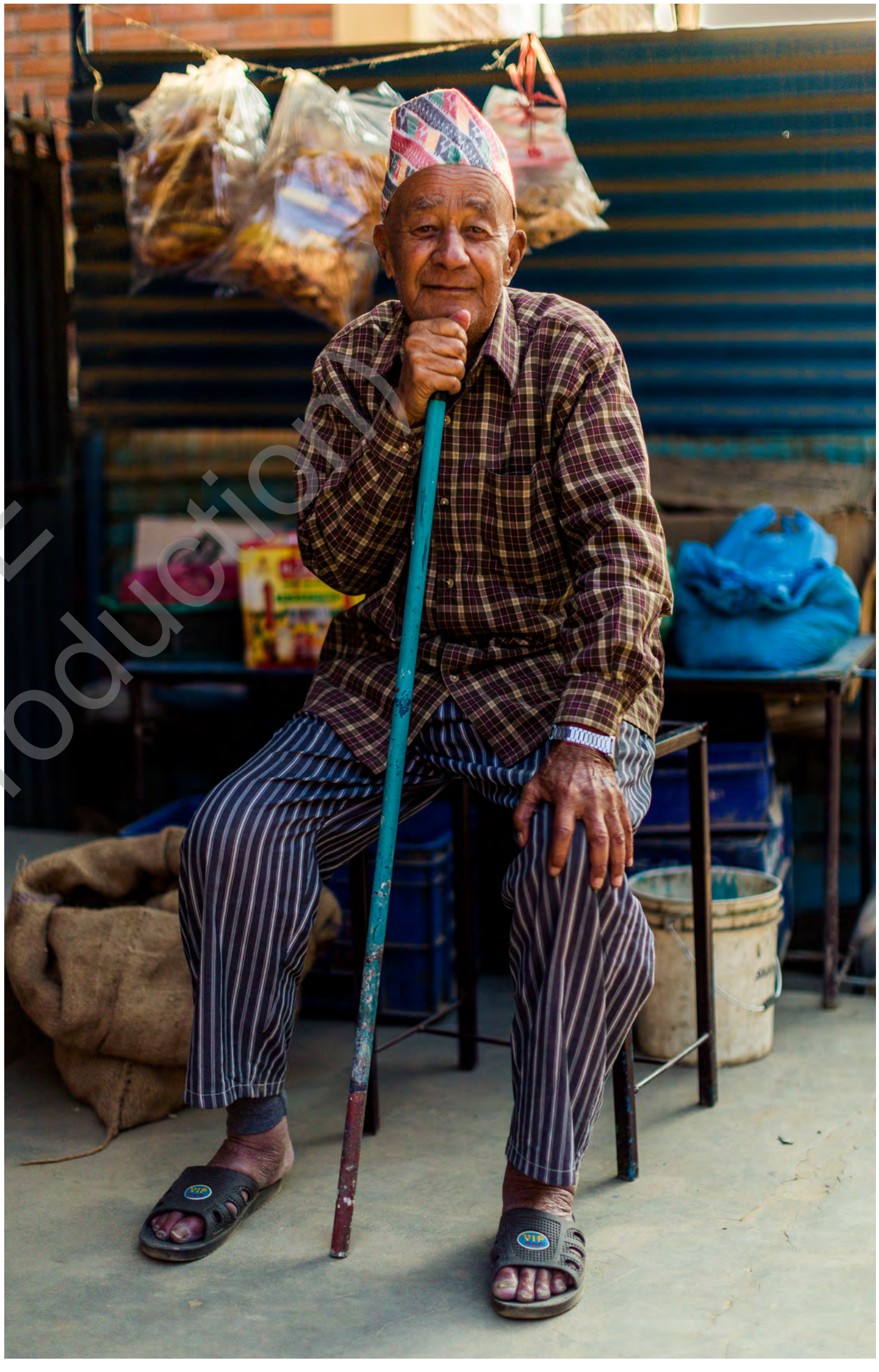
Do not forget to show hospitality to strangers, for by so doing some people have shown hospitality to angels without knowing it. - Hebrews 13:2 NIV (Nepal)