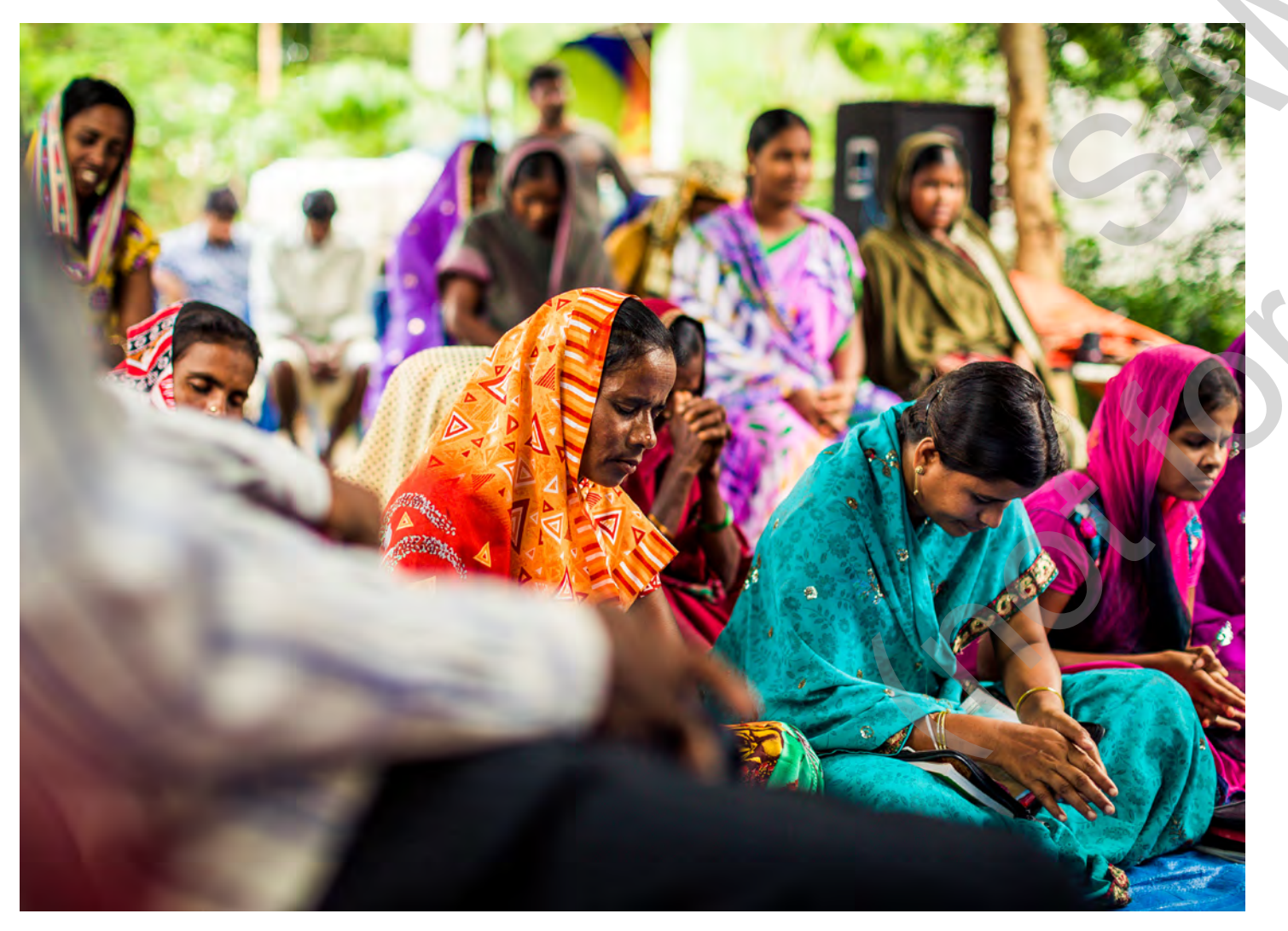
The fear of the Lord is the beginning of wisdom, and the knowledge of the Holy One is insight. For by me your days will be multiplied, and years will be added to your life. - Proverbs 9:10-11 (India)