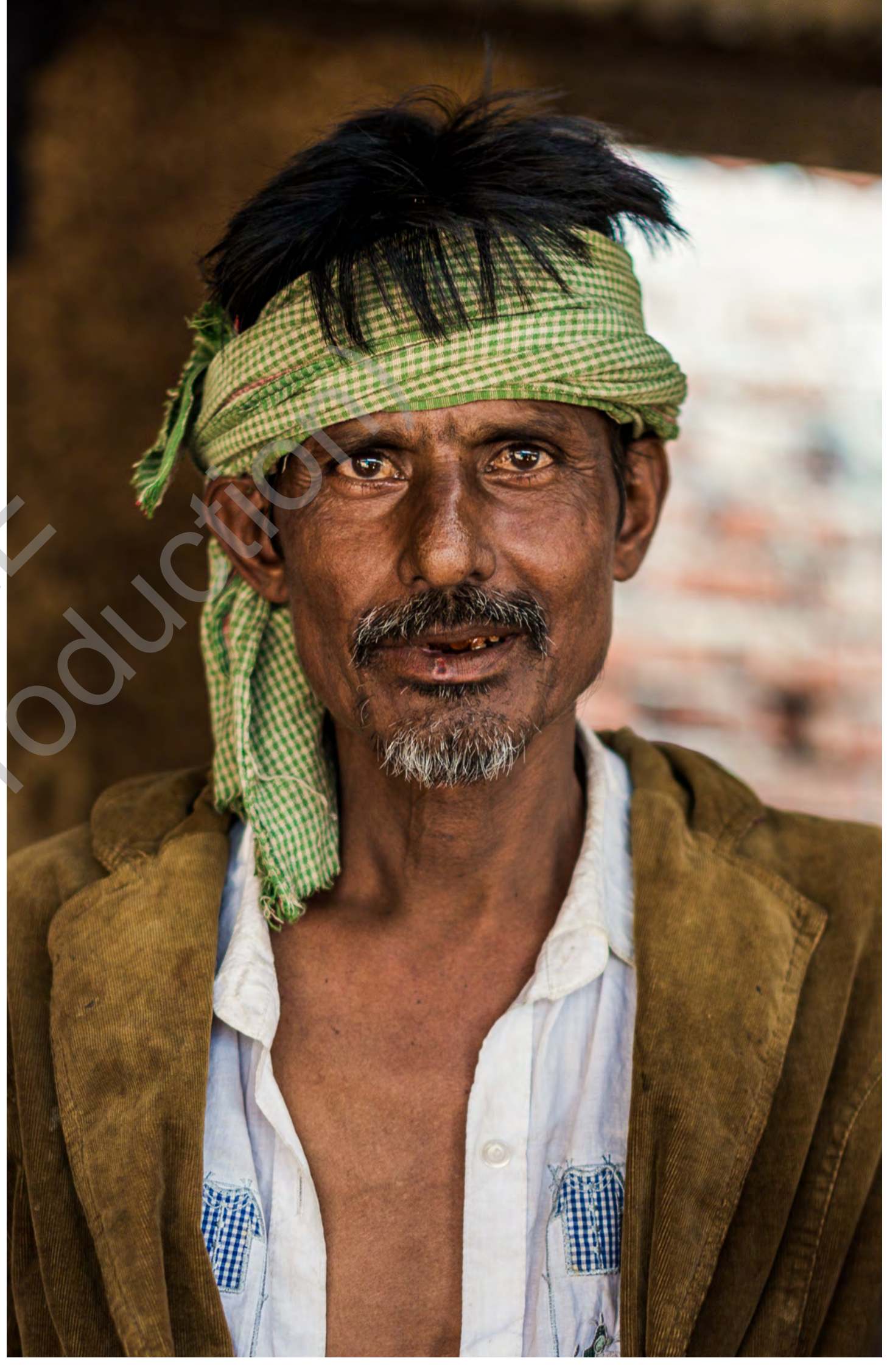
Thus says the LORD of hosts, Render true judgments, show kindness and mercy to one another, do not oppress the widow, the fatherless, the sojourner, or the poor, and let none of you devise evil against another in your heart. - Zechariah 7:9 (India)