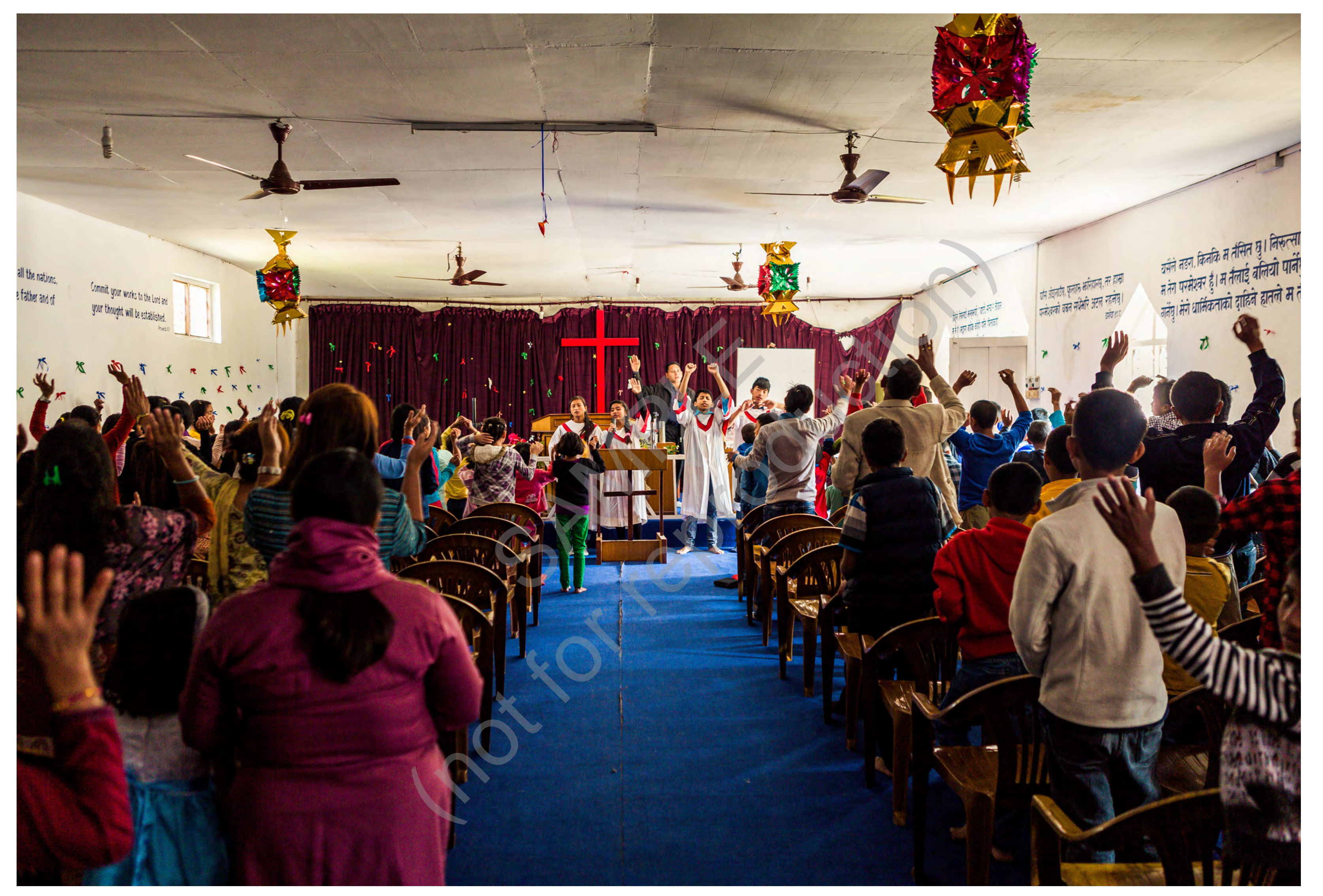
Want to have your heart broken by God? Try attending a church where the worship service is led by orphaned children. (Nepal)