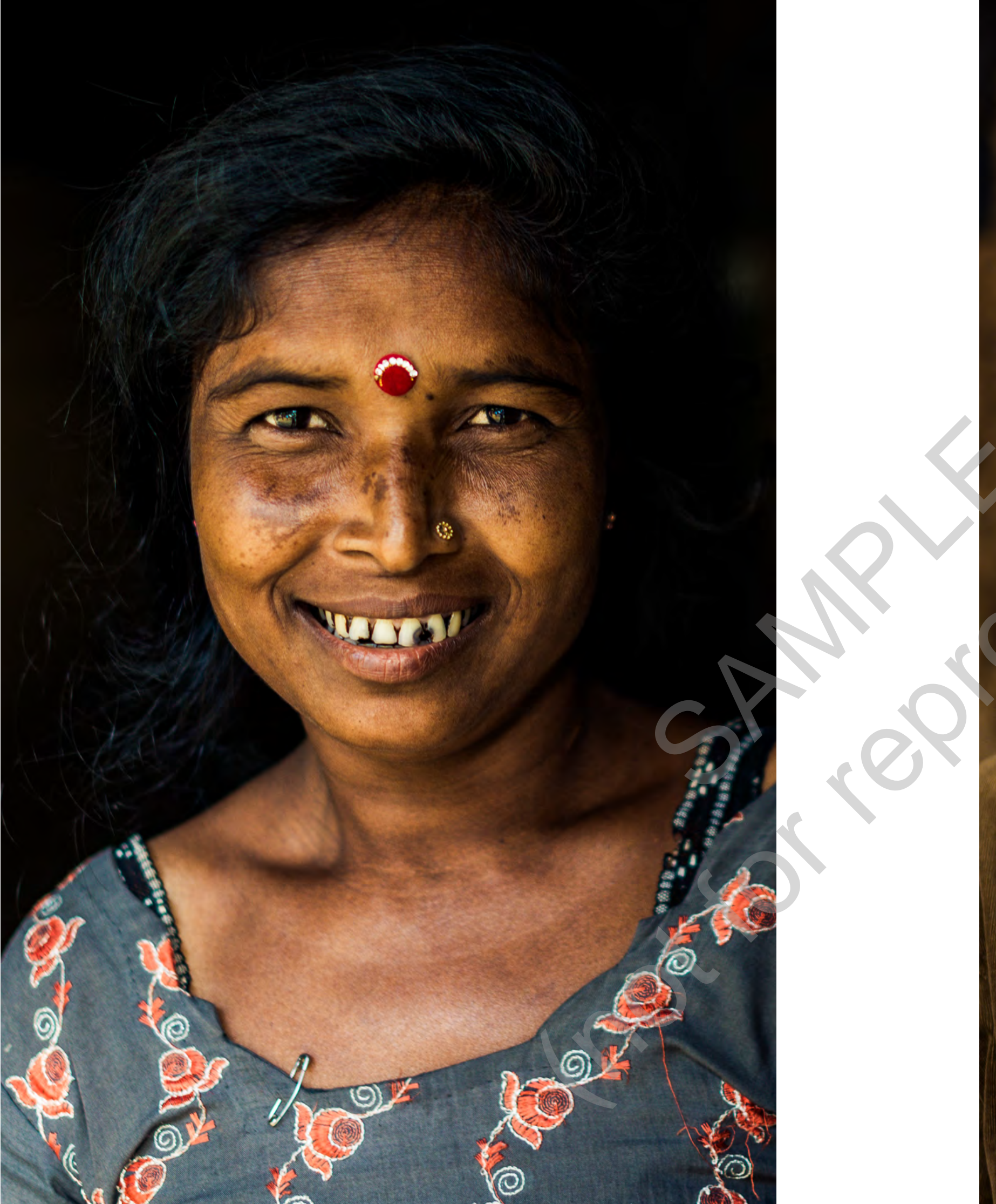
The fear of the LORD is a fountain of life, turning a person from the snares of death. - Proverbs 14:27 NIV (India)