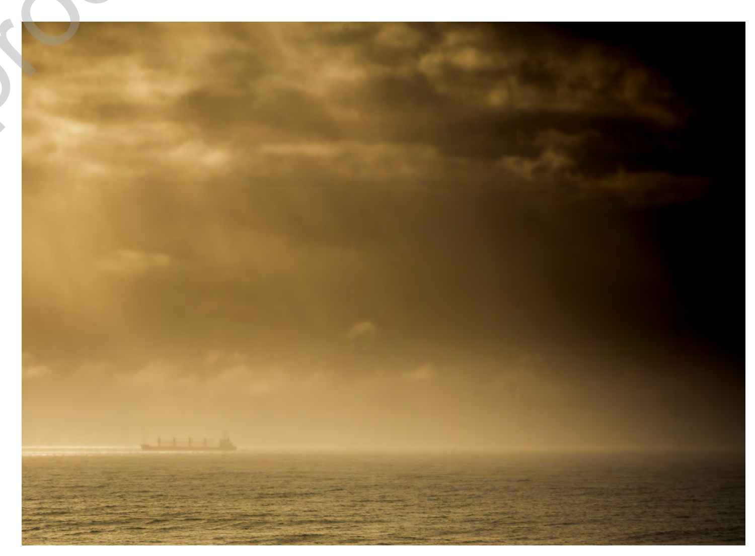
He draws up the drops of water, which distill as rain to the streams; the clouds pour down their moisture and abundant showers fall on mankind. - Job 36:27-28 NIV (India)