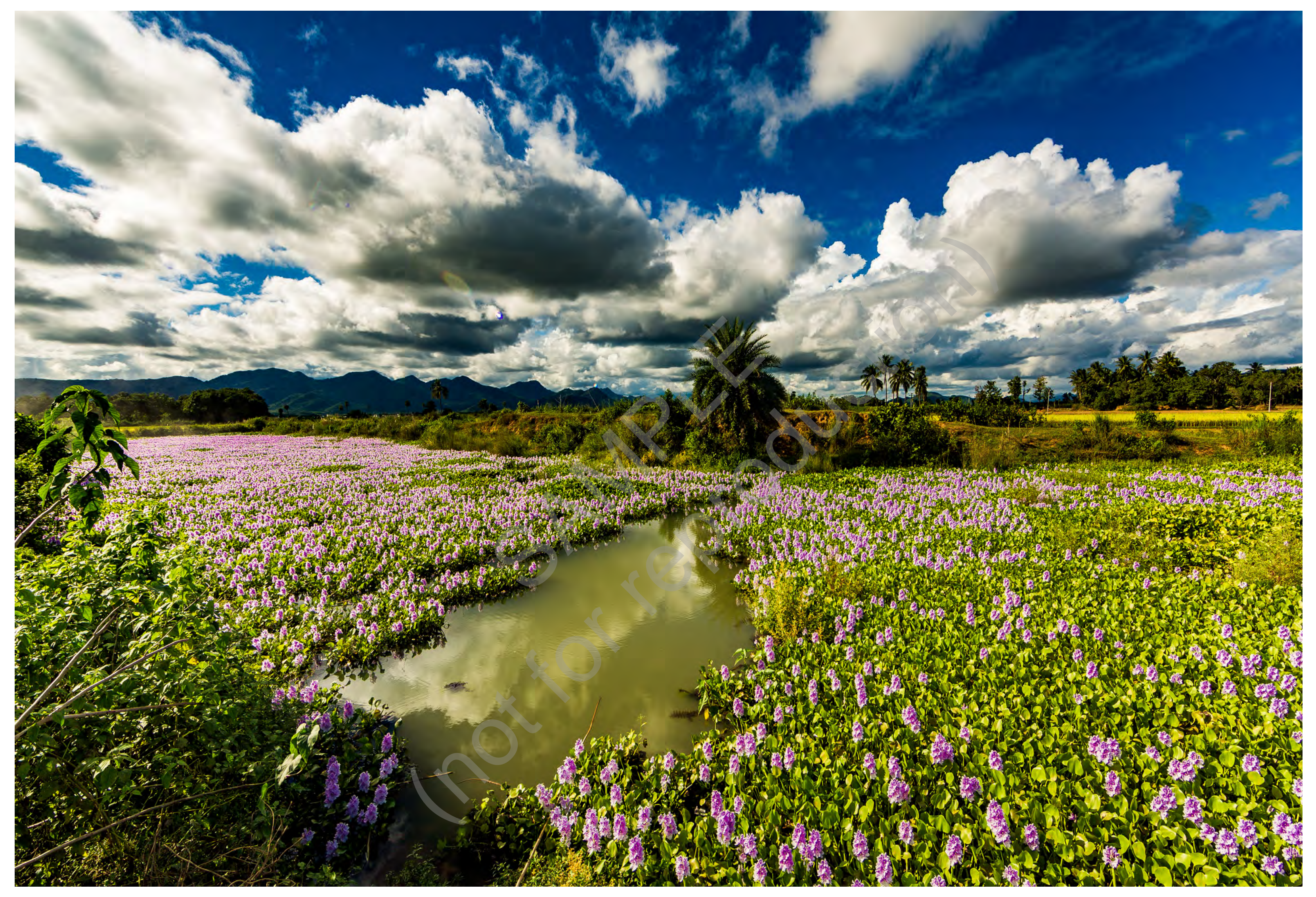
The grass withers, the flower fades, but the word of our God will stand forever. - Isaiah 40:8 (India)