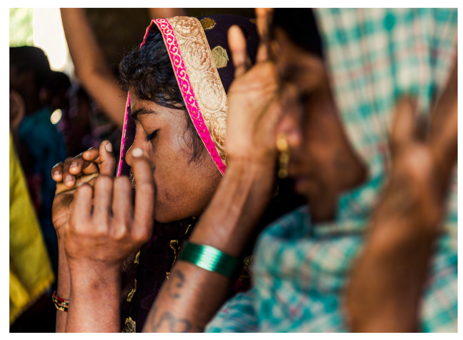
Worthy are you, our Lord and God, to receive glory and honor and power, for you created all things, and by your will they existed and were created. - Revelation 4:11 (India)