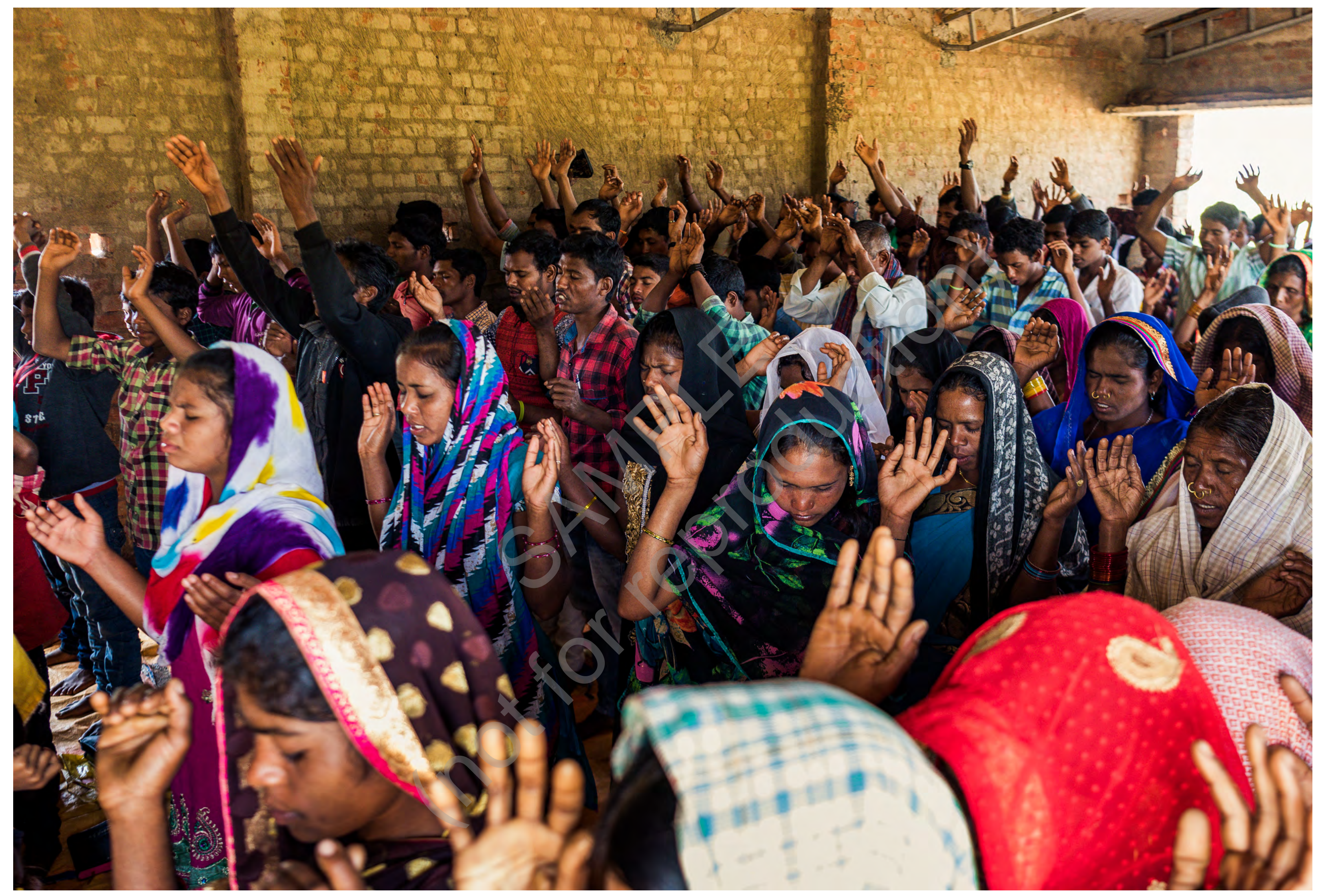
The mountains saw you and writhed; the raging waters swept on; the deep gave forth its voice; it lifted its hands on high. The sun and moon stood still in their place at the light of your arrows as they sped, at the flash of your glittering spear. - Habakkuk 3:10-11 (India)