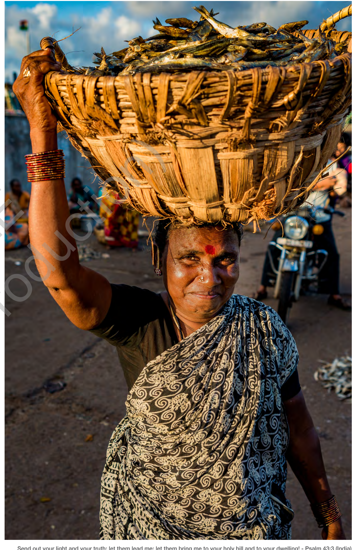
Send out your light and your truth; let them lead me; let them bring me to your holy hill and to your dwelling! - Psalm 43:3 (India)