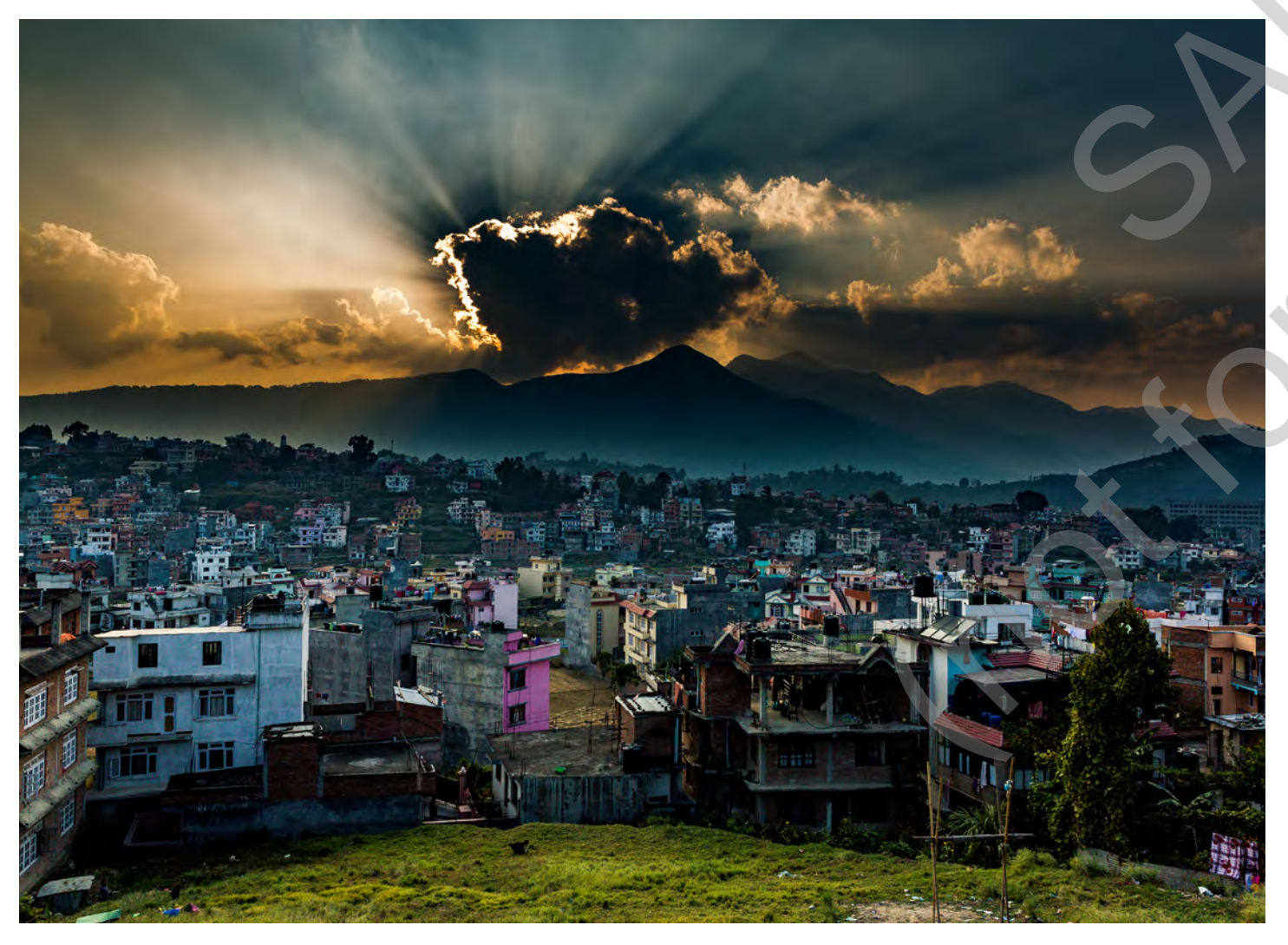
But for you who fear my name, the sun of righteousness shall rise with healing in its wings. You shall go out leaping like calves from the stall. - Malachi 4:2 (Nepal)