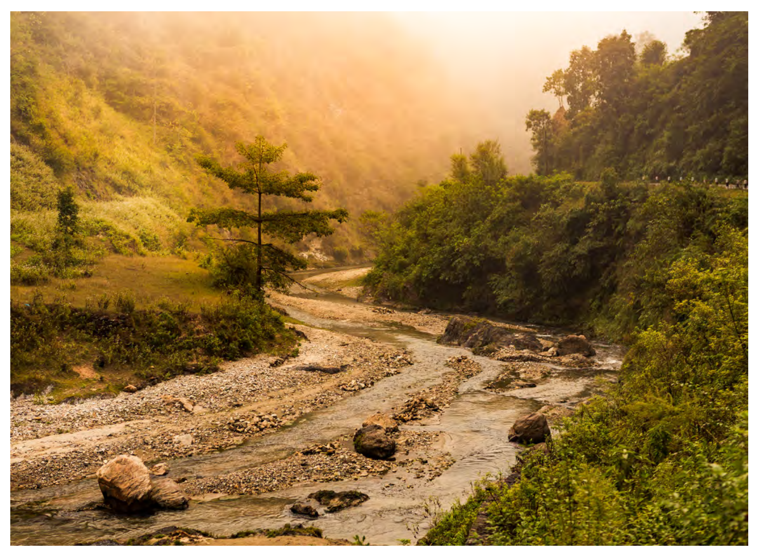
You make springs gush forth in the valleys; they flow between the hills. - Psalm 104:10 (Nepal)