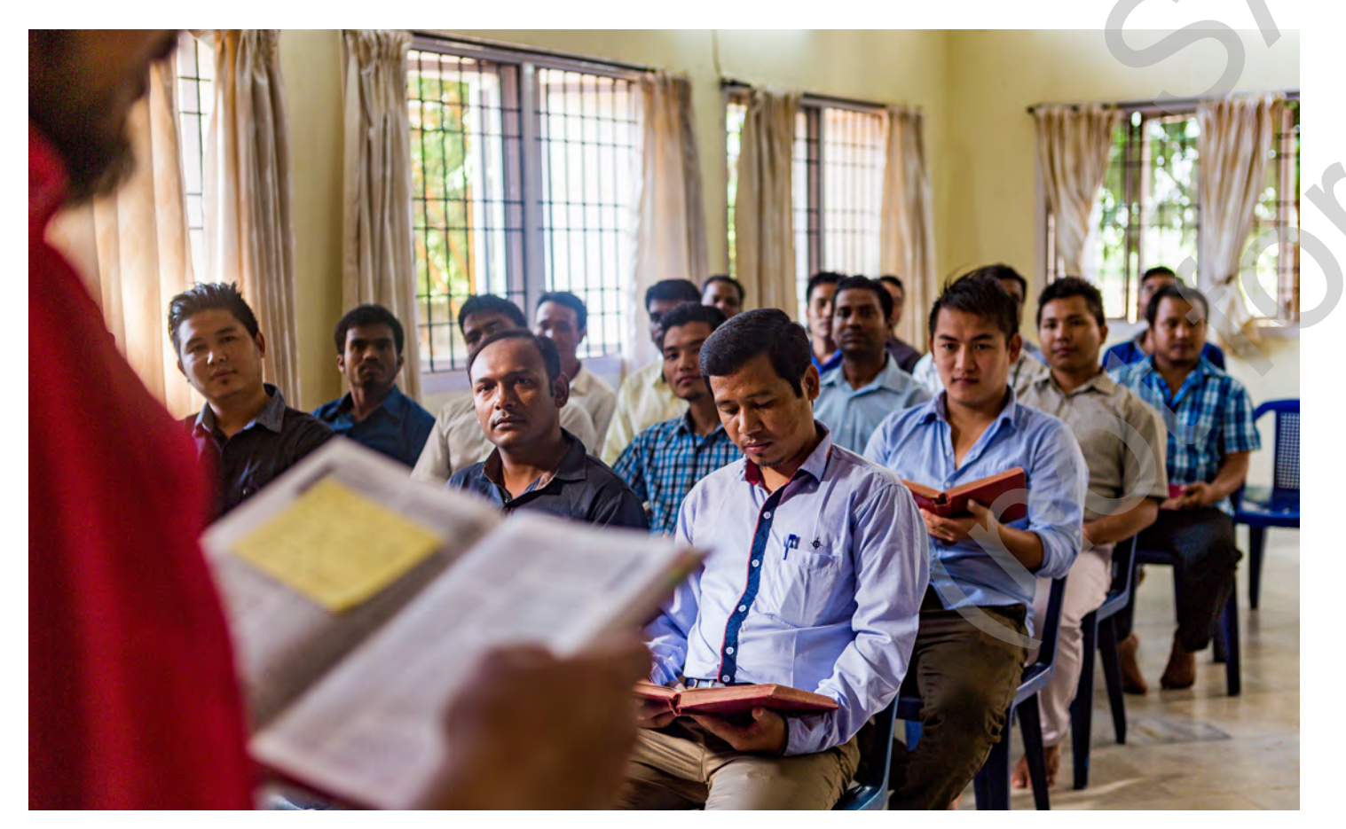
But now, O LORD, you are our Father; we are the clay, and you are our potter; we are all the work of your hand. - Isaiah 64:8 (India)

Therefore, if you're going to use only one filter for this book, let it be this one. If you read anything in unOblivious that comes across like I'm being arrogant or seeking the praise of men, please know that is not my intention and give me the benefit of the doubt. These are images of His creation, not mine. I am a sinner, unworthy of His grace, but through Christ, He has called me to Himself that I might serve Him for the rest of my life.