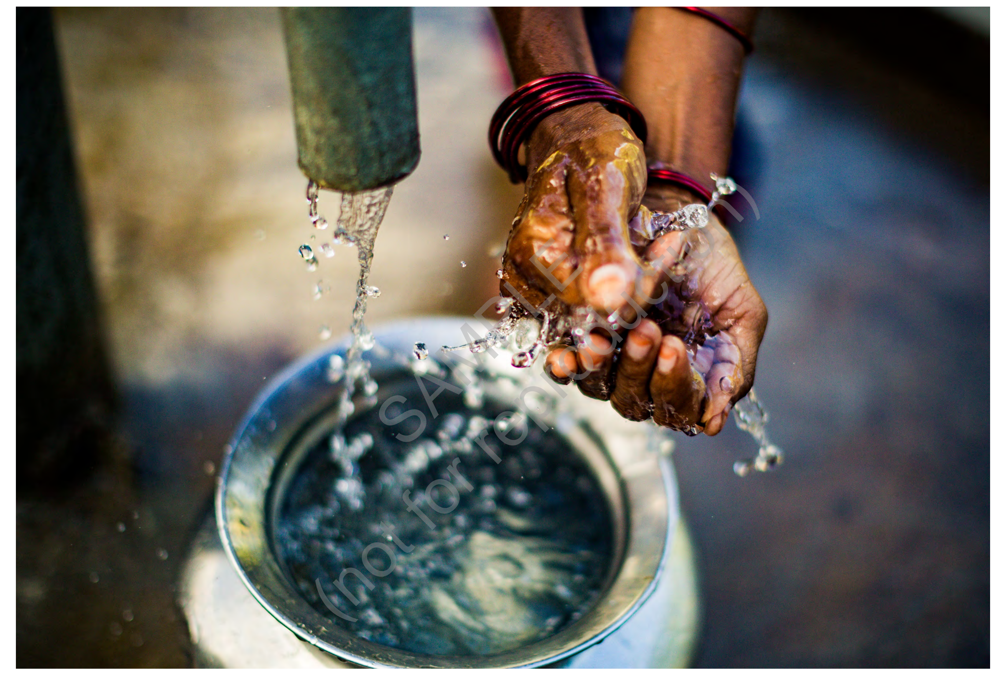
But whoever drinks of the water that I will give him will never be thirsty again. The water that I will give him will become in him a spring of water welling up to eternal life. - John 4:14 (India)