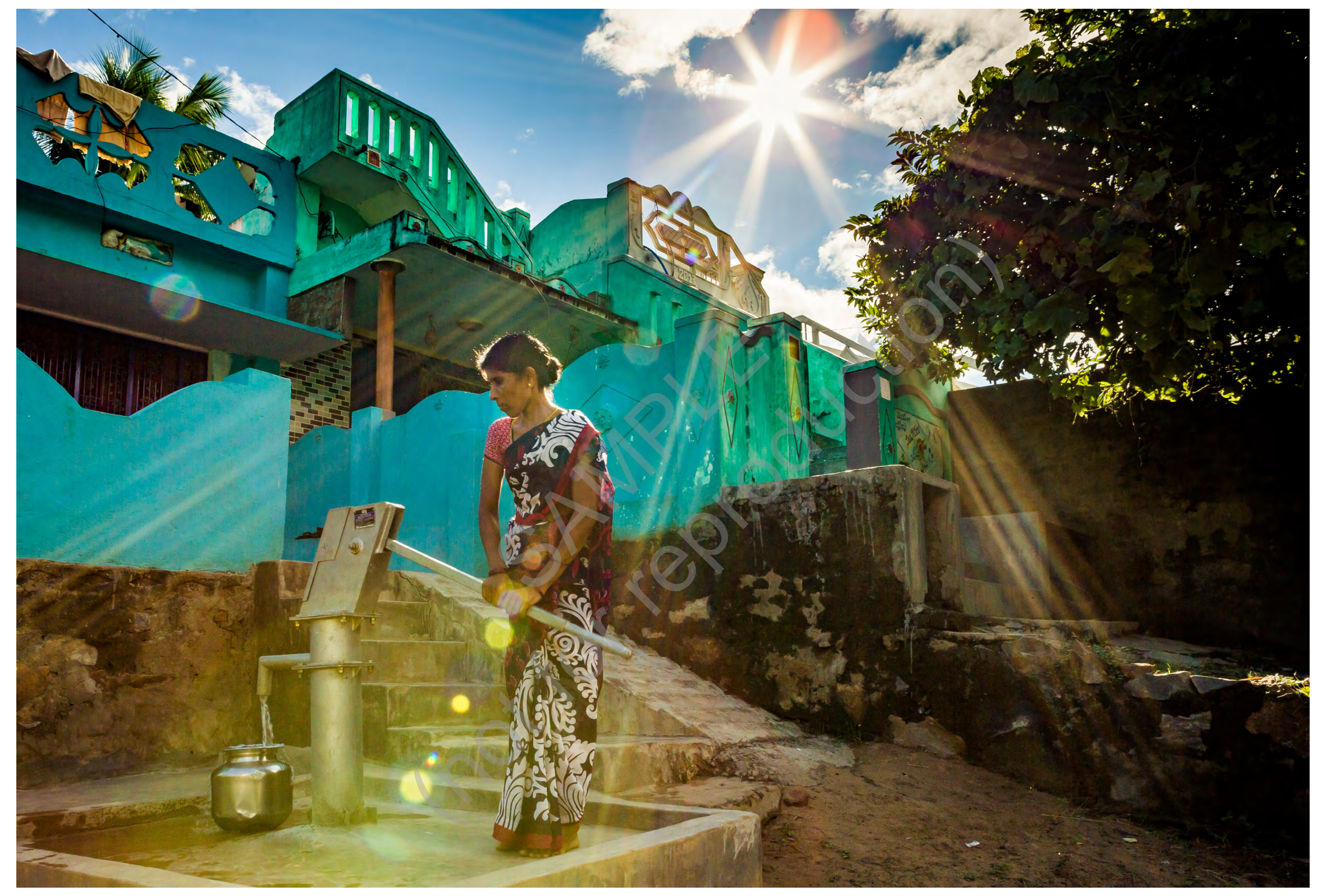
Taste and see that the Lord is good; blessed is the one who takes refuge in him. - Psalm 34:8 NIV (India)