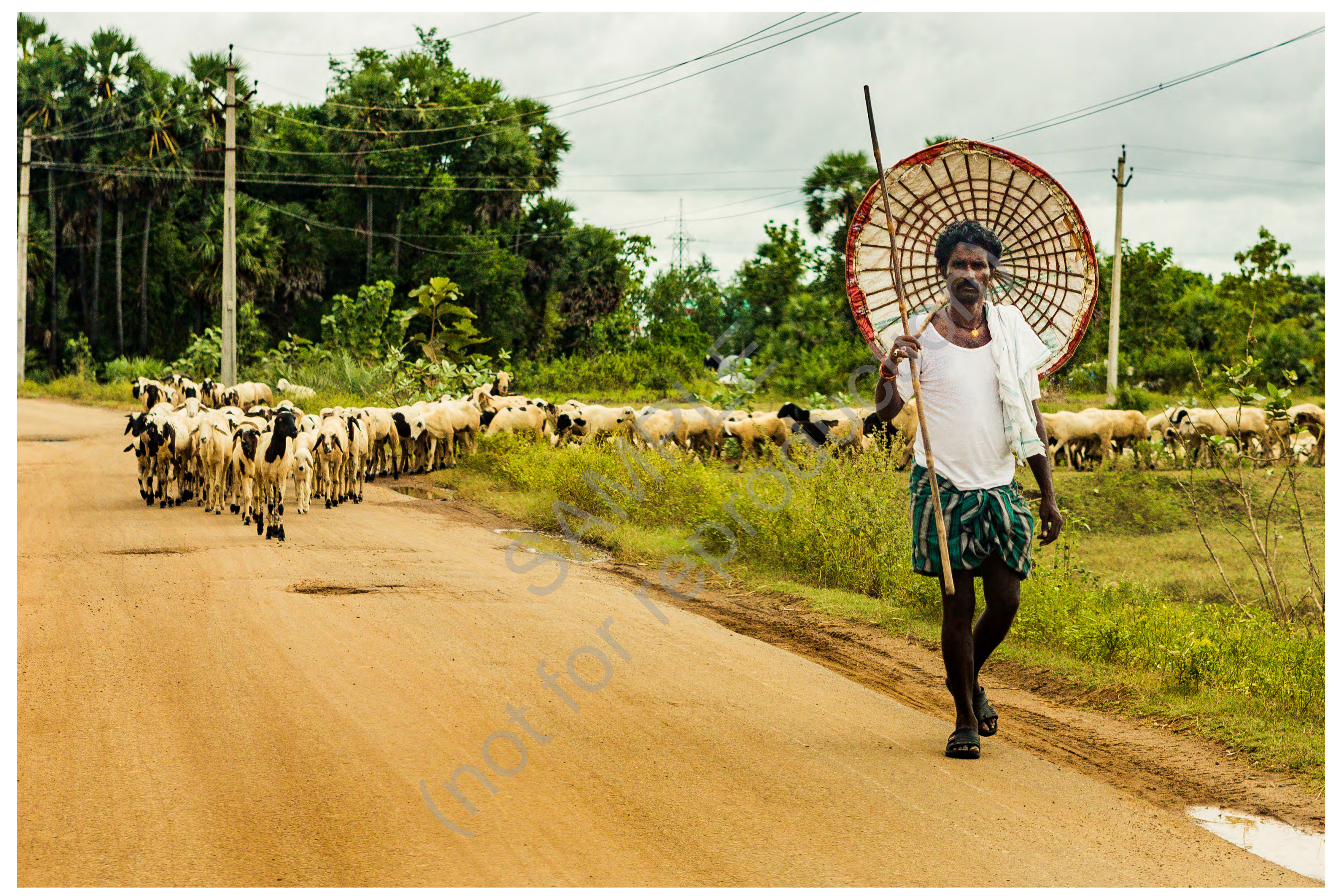
Fear not, little flock, for it is your Father's good pleasure to give you the kingdom. Sell your possessions, and give to the needy. Provide yourselves with moneybags that do not grow old, with a treasure in the heavens that does not fail, where no thief approaches and no moth destroys. For where your treasure is, there will your heart be also. - Luke 12:32-34 (India)